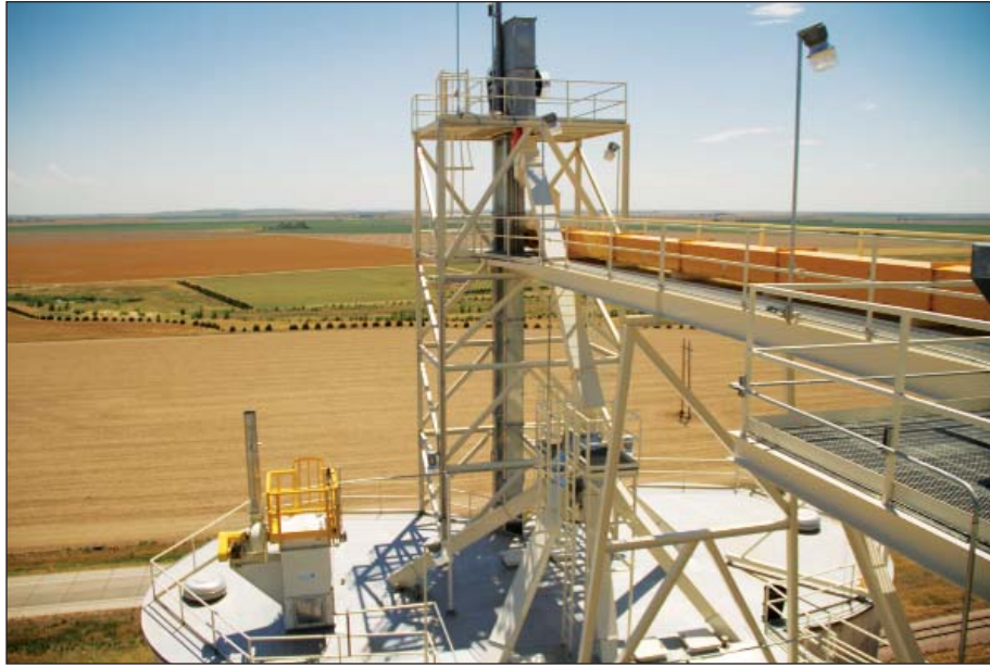
Hayes & Stolz bucket elevator head section and Tramco conveyor system carry received ingredients to a Hayes & Stolz distributor.