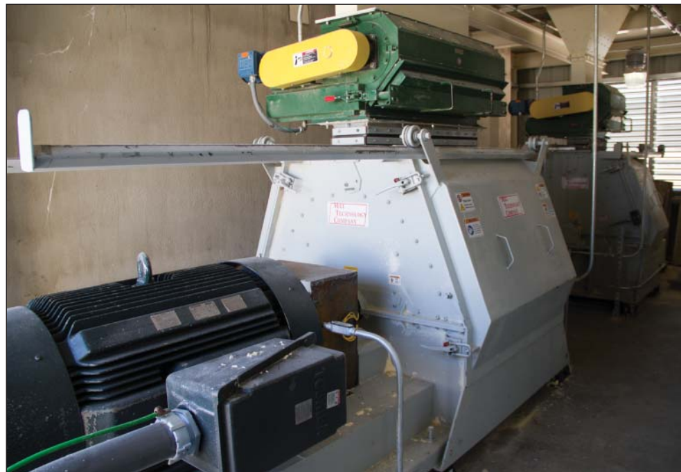
Mill Technology hammermills grind at 40 and 20 tph, respectively.