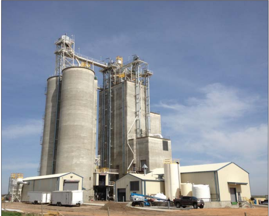
Seaboard Foods' new 4,500-tpw feed mill in Holyoke, CO, which is being primarily used for swine feeds at Seaboard swine farms in the area.

With 38 swine farms within short trucking distance from Holyoke, CO, Seaboard Foods was looking for a feed mill location that could serve the surrounding area better. The new mill in Holyoke (970-520-3724)