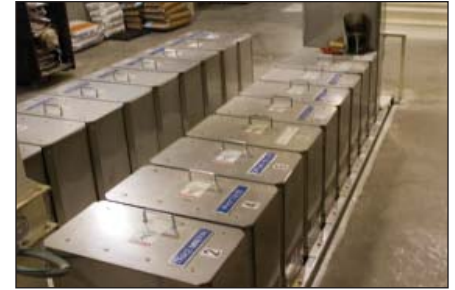
A 20-bin Sudenga microingredient system.

Pelleting is done on a 45-tph Buhler pelleting system. A Buhler conditioner and retentioner adds steam and retention to the mix, before a Buhler Optiflow feeder feeds conditioned mash evenly into the pellet mill. Fat can be added at the die. After pelleting, the feed runs