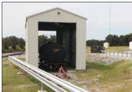
Top photo: Annex building for pellet production; fat liquid storage tanks in foreground, and truck receiving on right (ground level). Bottom photo: Fat liquid receiving and piping to facility.

sign engineer and general contractor, to convert and upgrade the facility to produce 16 formulations of pelleted turkey feed, as well as expand its railcar receiving/unloading and grain storage capacities up to 20,000 bph and 750,000 bushels, respectively.