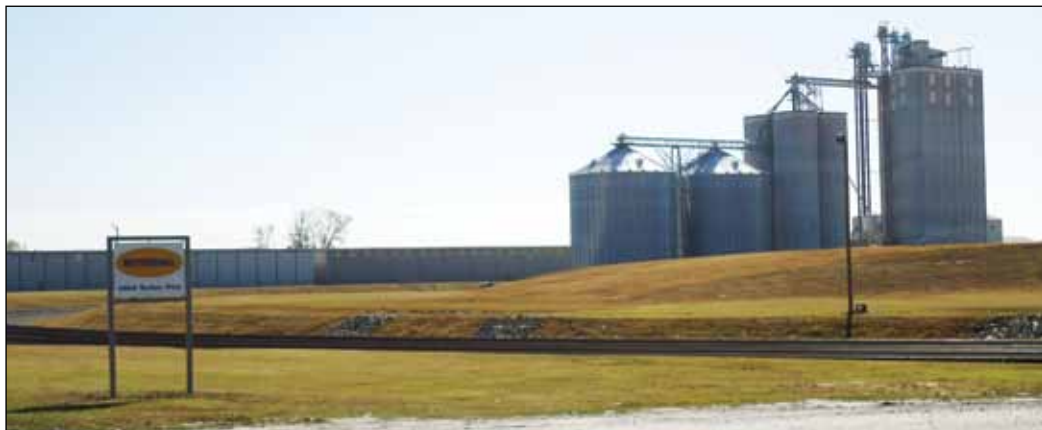
Looking towards the southeast is a Butterball, LLC pelleted turkey feed production facility, Turkey, NC.

Aeration system ..... Safe-Grain Inc. Bin level monitors .... Monitor Technologies LLC, Bindicator, Dyna-Trol Bin sweeps ..... Brock Grain Systems Boiler ..... Cleaver-Brooks Bucket elevators ..... Intersystems Contractor ... W.L. Port-Land Systems, Inc. Control system ..... Repete Corp. Conveyors (drag/belt) . Intersystems Distributors ..... Hayes & Stolz Ind. Mfg. Co. Inc. Elevator buckets ..... Maxi-Lift Inc. Engineering ..... W.L. Port-Land Systems, Inc. Fat coater .. Hayes & Stolz Ind. Mfg. Co. Inc. Gates/diverters .. Tom-Cin Metals Inc. Grain temperature system ... Safe-Grain Inc. Liquid fat tanks .. CP Metal Crafters Inc. Motion sensors ..... Maxi-Tronic Inc., 4B Components Ltd., Ramsey Electronics Pellet cooler ..... Bliss Industries Inc. Pellet crumbler .. Bliss Industries Inc. Pellet mill ..... CPM Roskamp Champion Pellet screeners ..... Rotex Inc. Screw conveyors ..... Conveyors Inc. Steam conditioner ..... Andritz Inc. Steel storage ... Brock Grain Systems