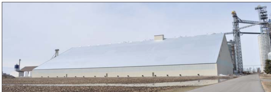
New flat storage building at Ulen, MN was constructed directly over an existing temporary storage pile. It currently can hold 3 million bushels and, with modifications, could hold 3.5 million.

The upgraded flat storage has an asphalt floor and a set of 30 10-hp AIRLANCO axial aeration fans. The building is set up with doors to admit front-end loaders and semi-trucks for unloading.