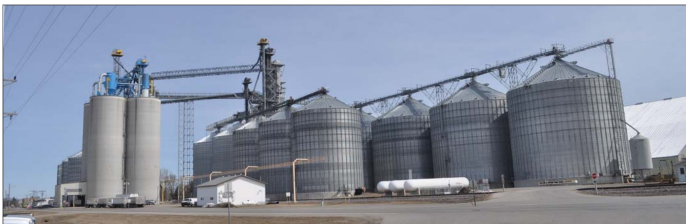
Two West Central Ag Services elevators were upgraded in 2017. At top, the branch elevator at Beltrami, MN, now with 3 million bushels of storage. Below, the headquarters elevator at Ulen, MN, now with 7.7 million bushels.