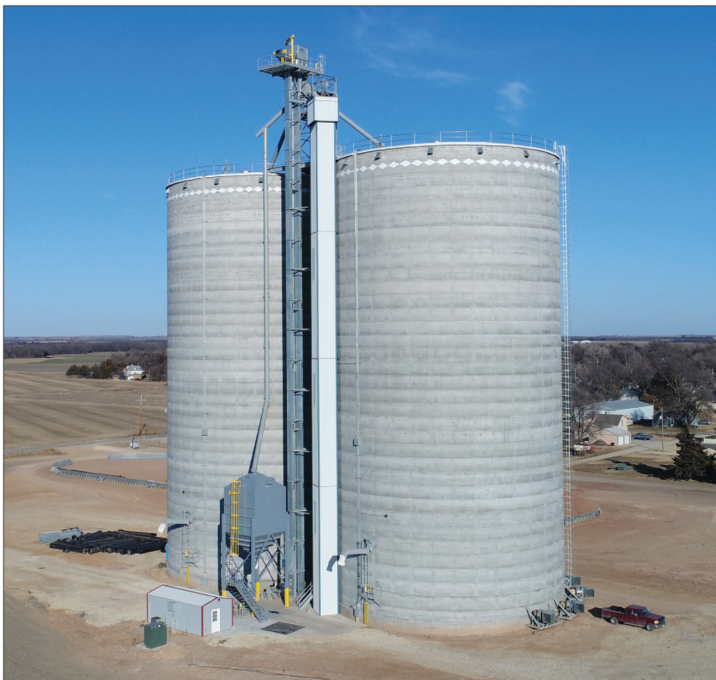
Delphos Cooperative Association's new 1-million-bushel annex about a quarter mile away from its headquarters facility in Delphos, KS.