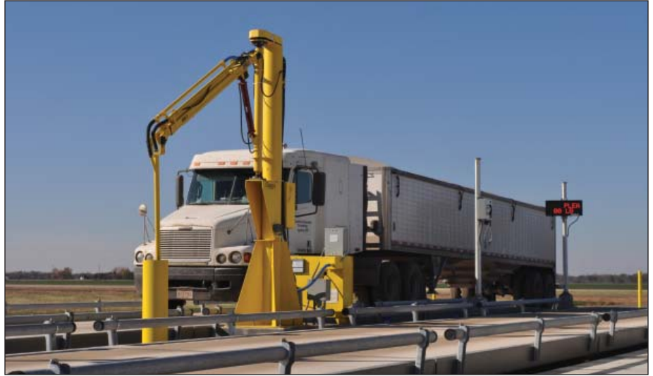
A truck driver moves onto a Mettler Toledo outbound scale after delivering grain. Also visible is the inbound scale and an Apollo truck probe.

Vigen constructed a 1.1-million-bushel slipform concrete grain elevator that consists of eight 124,000-bushel tanks plus five interstices, three truck loadout bins, and one shipping bin. The big tanks are 40 feet in diameter