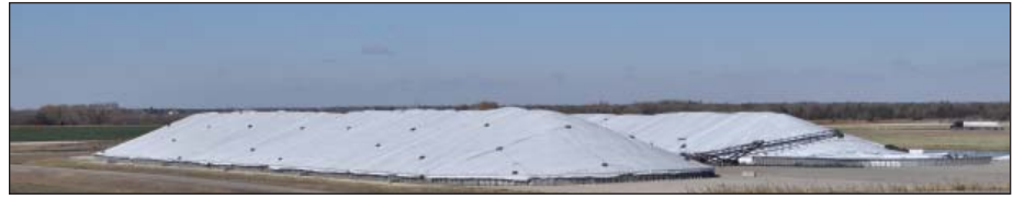
Two 1.1-million-bushel LeMar temporary storage piles, one holding wheat and the other corn in November 2014.

The upright storage tanks empty onto a 60,000-bph Hi Roller enclosed belt conveyors in a below-ground 11-ft.-wide-by-8-ft.-tall tunnel. These run back to a 40,000-bph Union Iron loadout leg outfitted with two rows of Maxi-Lift Tiger-Tuff 20x8 buckets on a 44-inch Goodyear belt. The other