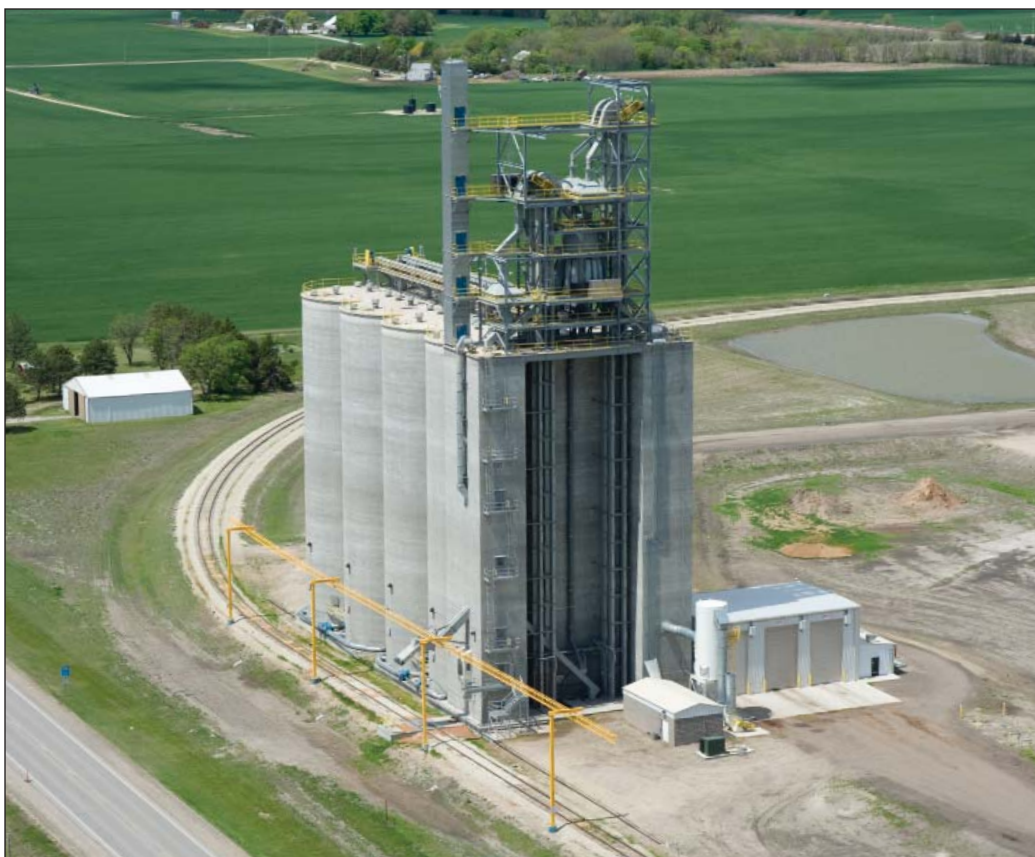
Producers Ag LLC's new 1.1-million-bushel slipform concrete elevator outside of Canton, KS nearing completion in November 2014.

Truck scale software ..... Cultura Technologies Inc.